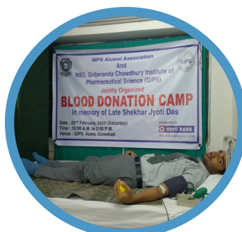
Blood donation camp