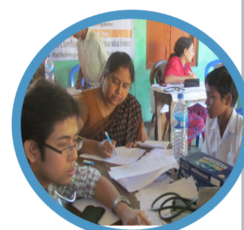
Free health camp