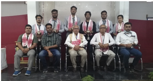
Graduate Pharmacy Aptitude Test (GPAT-2021) qualified candidates with Principal and Faculties, GIPS.

Graduate Pharmacy Aptitude Test (GPAT) is a national level entrance examination for admission in post-graduate pharmacy programme conducted by National Testing Agency (NTA) . GPAT qualified candidates receives scholarship and other forms of financial aids (in the field of pharmacy) from Government of India.