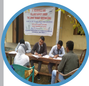
Unnat Bharat Abhiyan